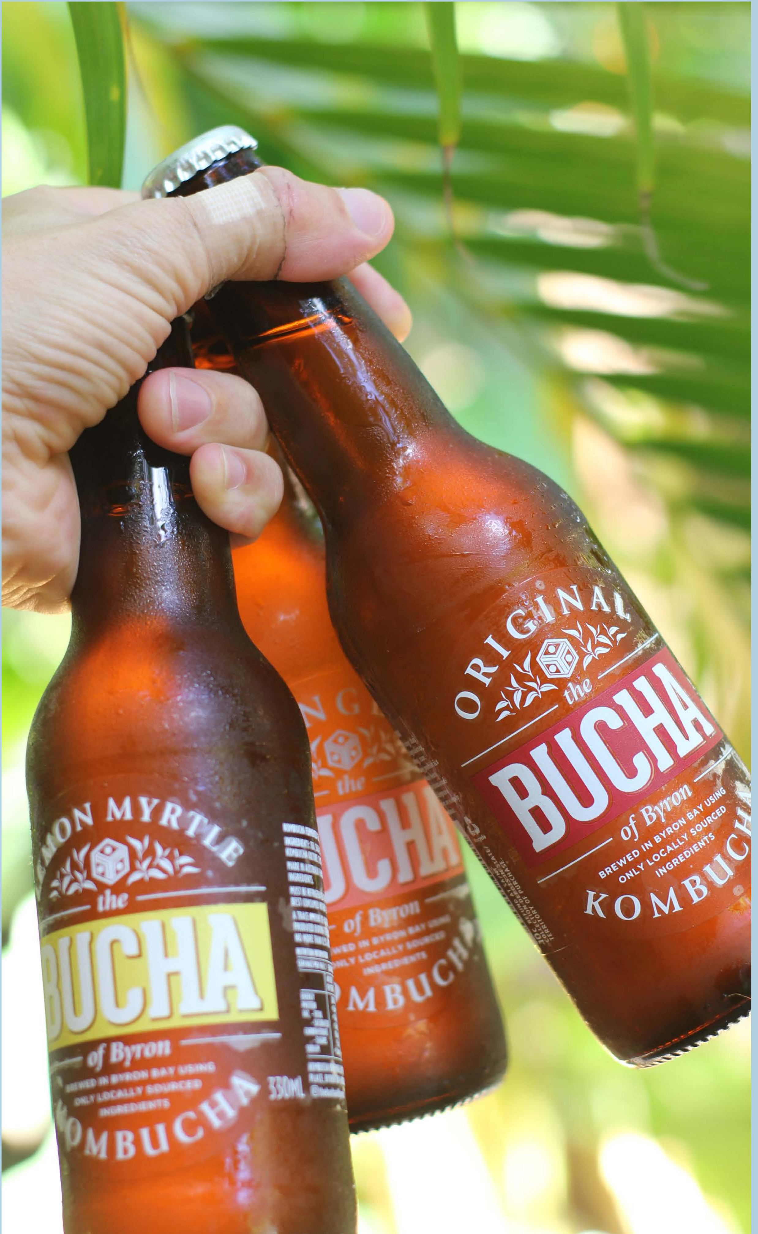
The Bucha of Byron