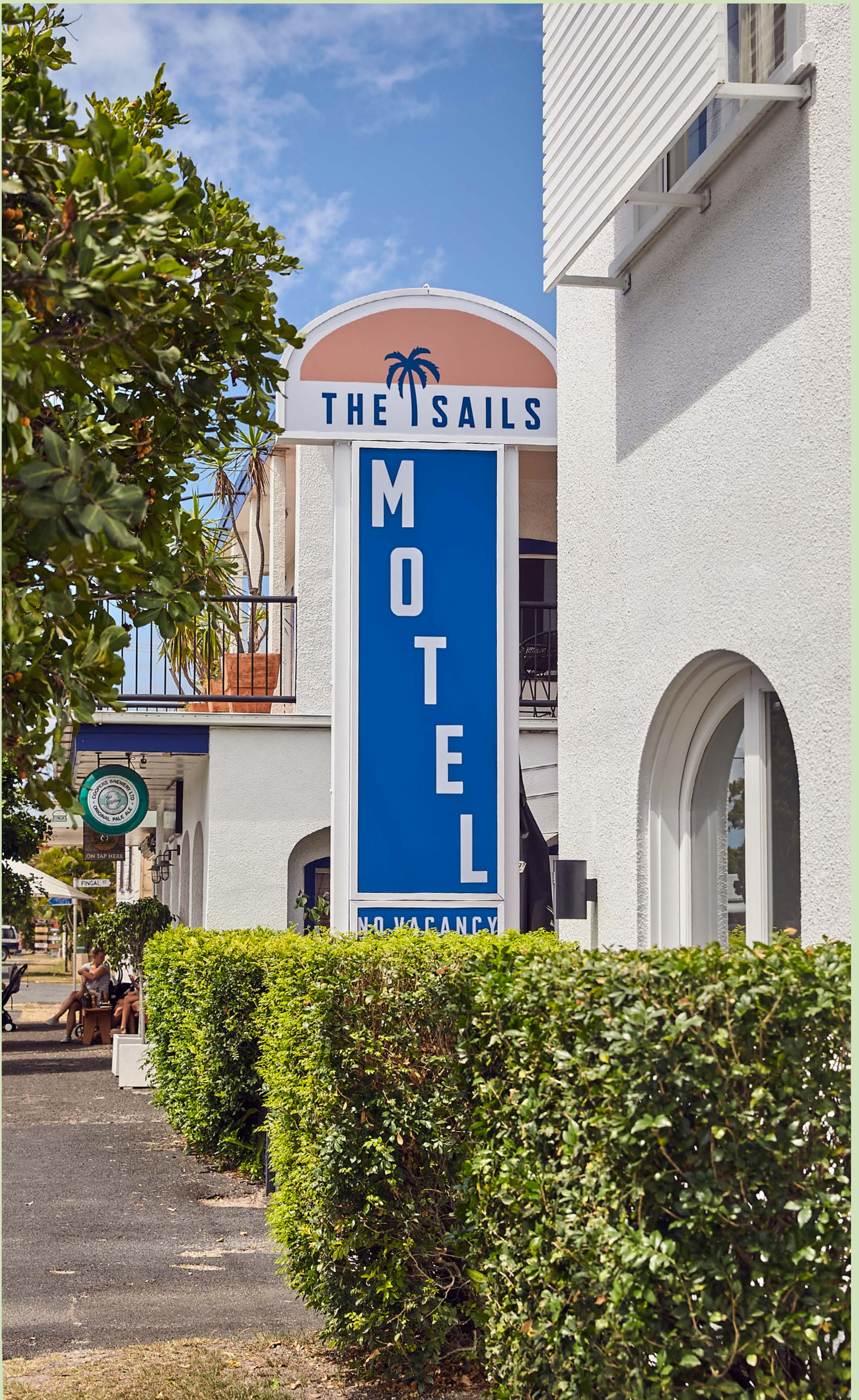
The Sails Motel