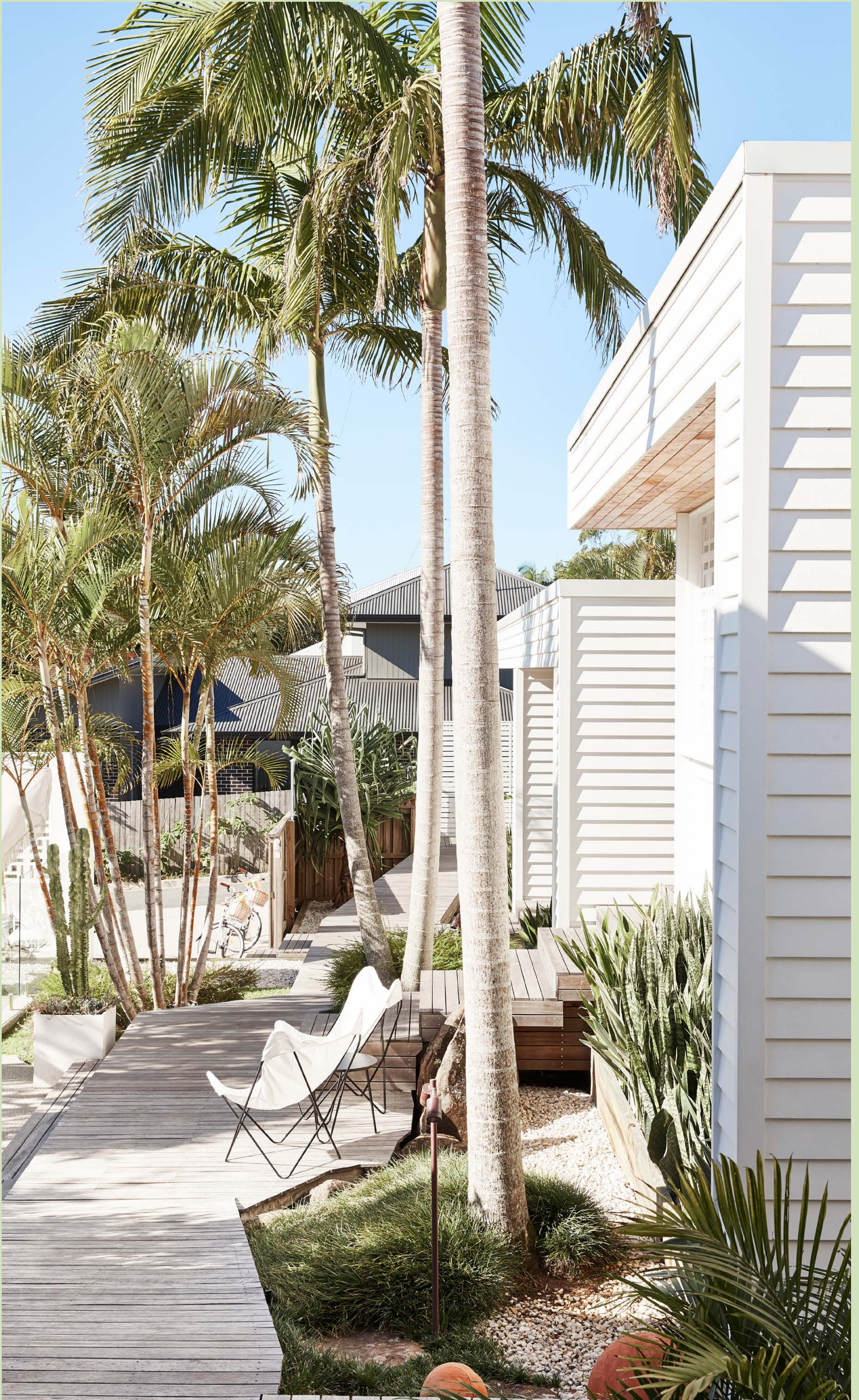
Bask & Stow