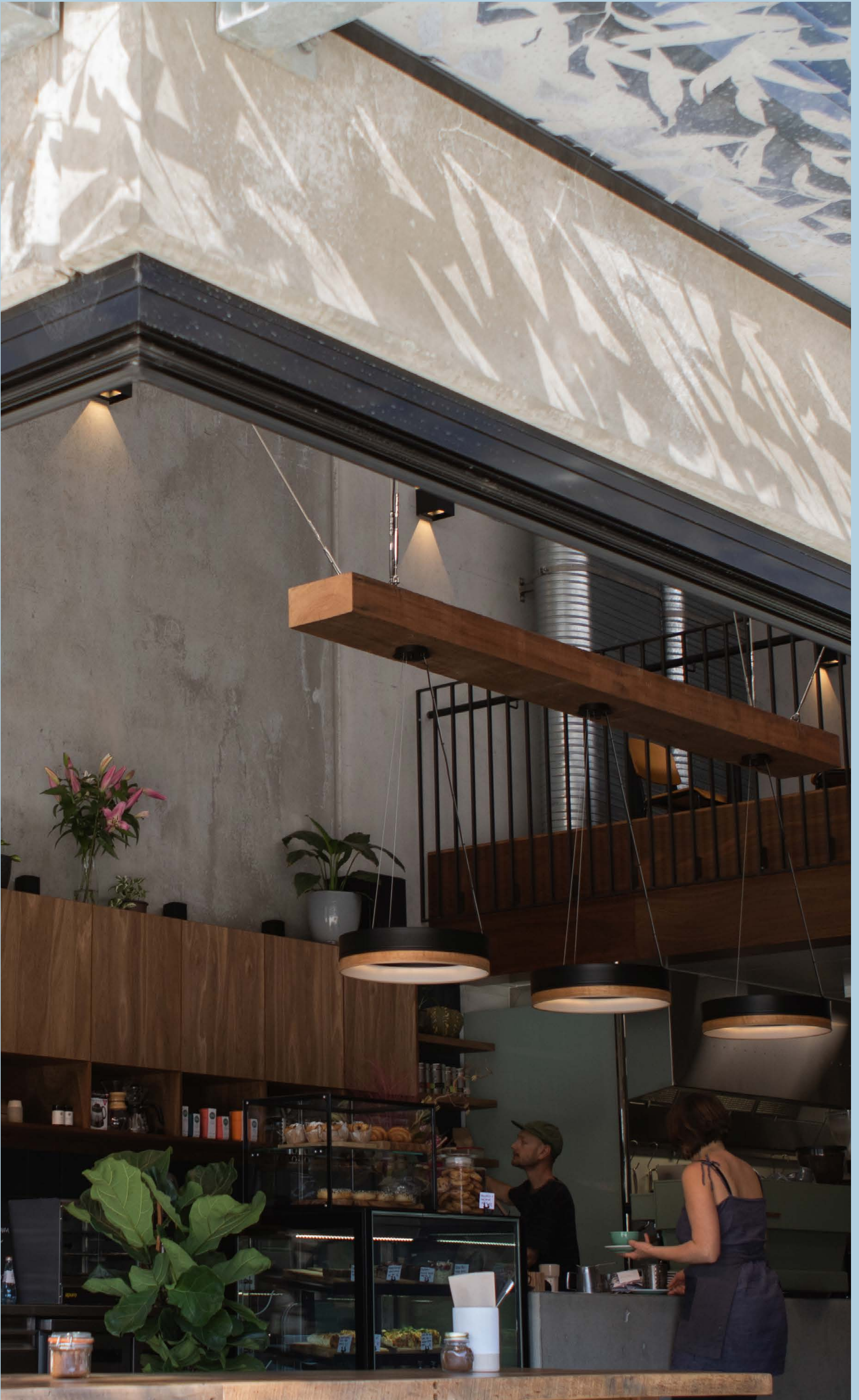
The Branches Coffee Roasters