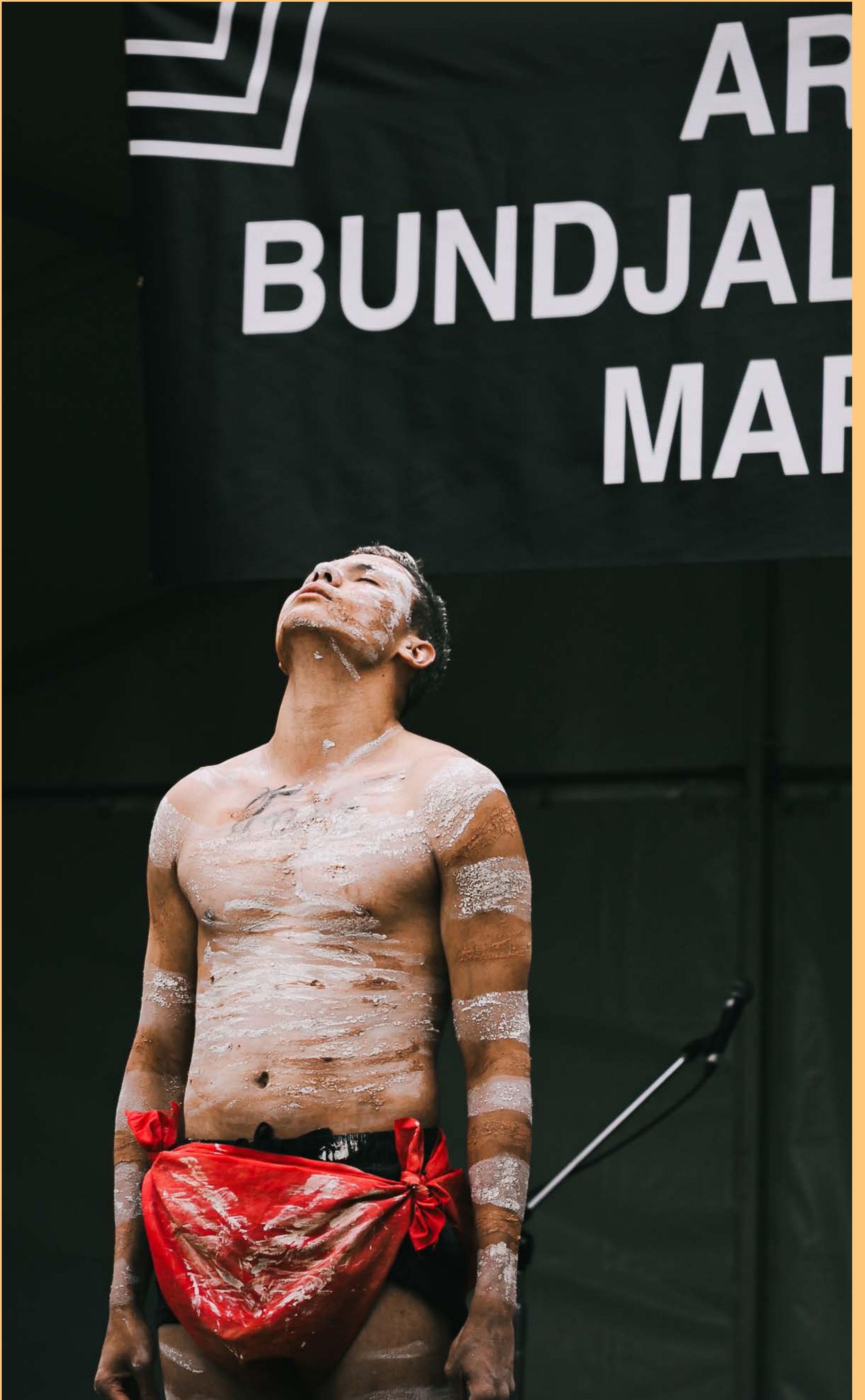
Arts Northern Rivers