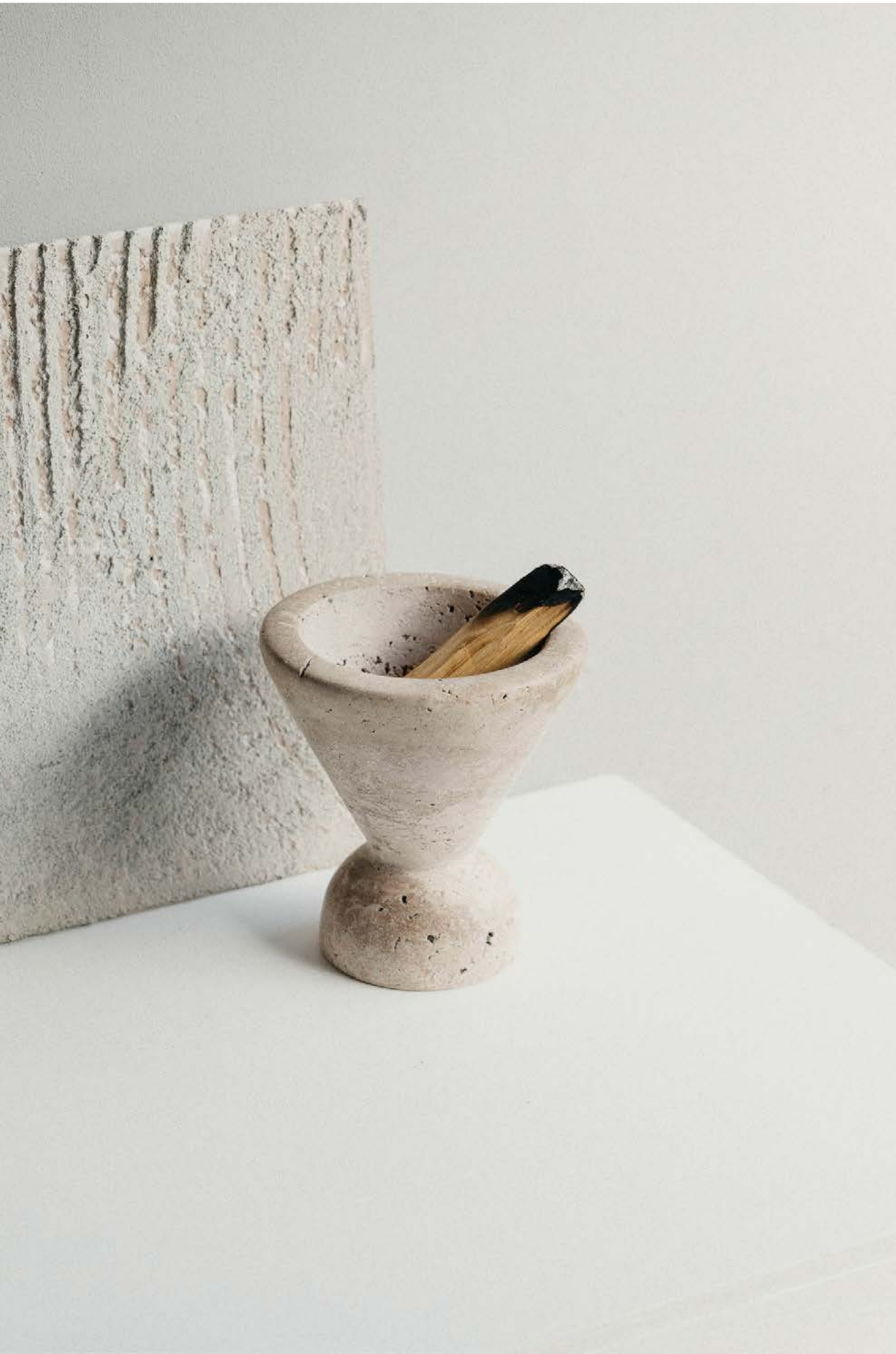
Northern NSW, Australia 2020