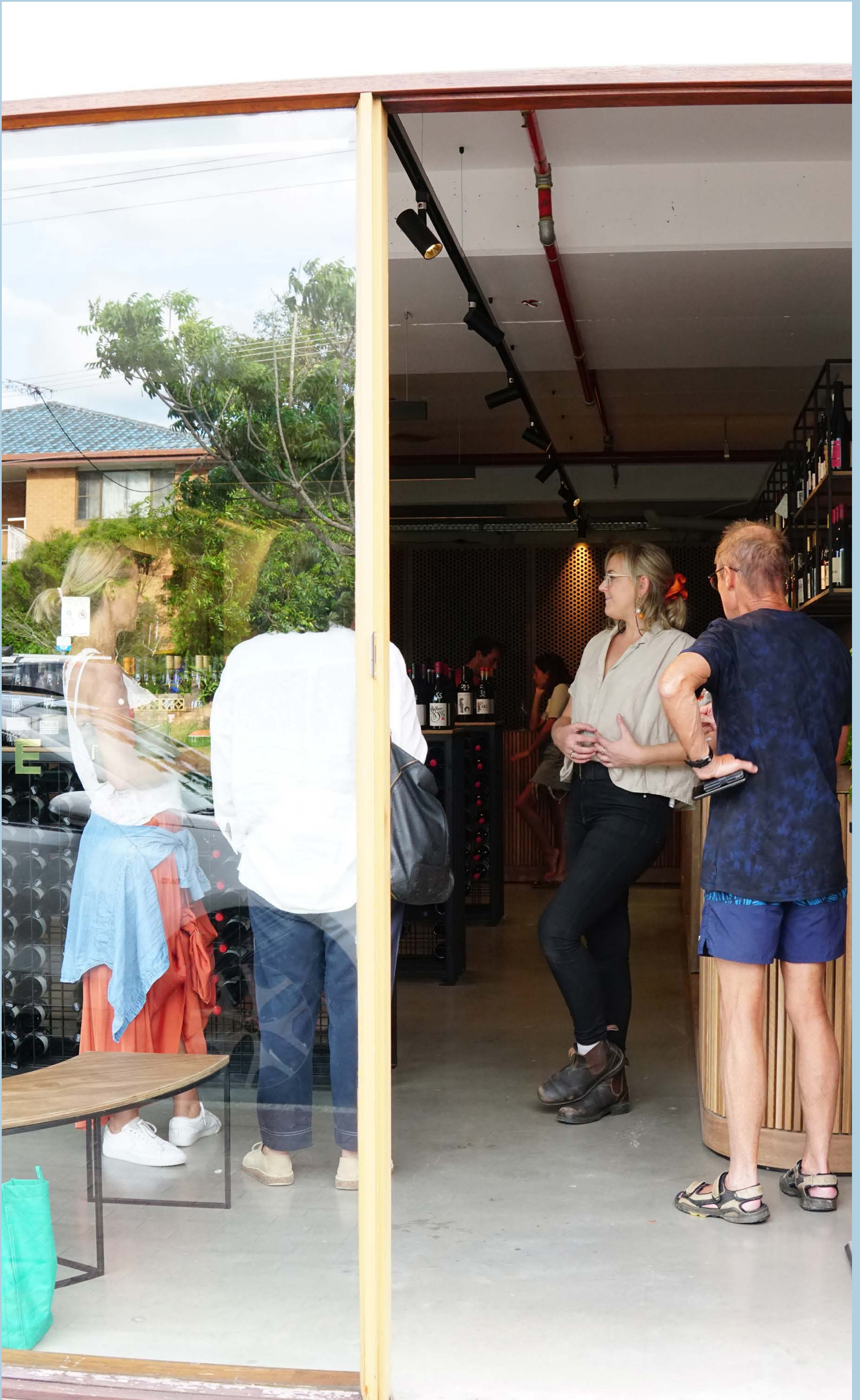
Luna Wine Store