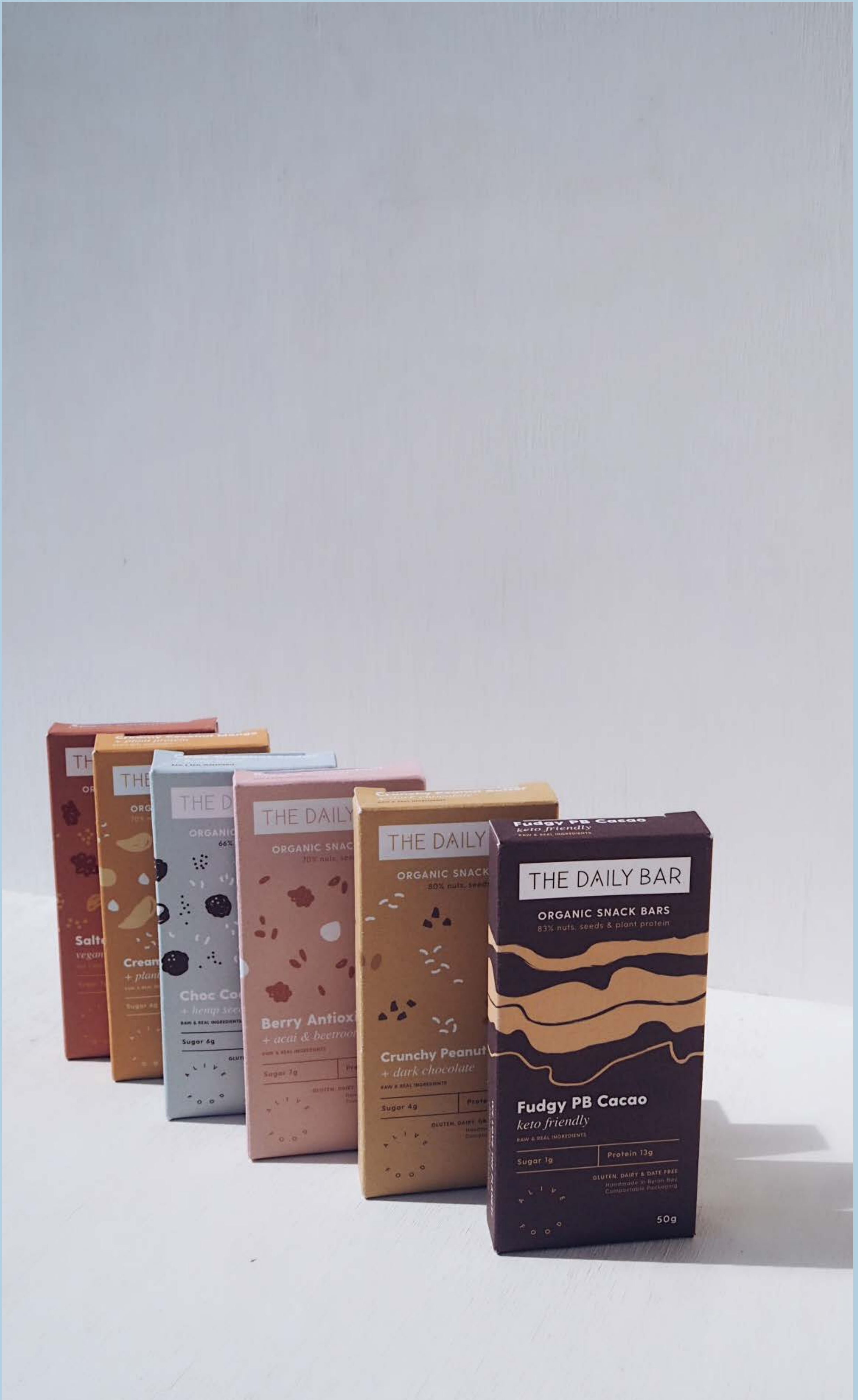
The Daily Bar