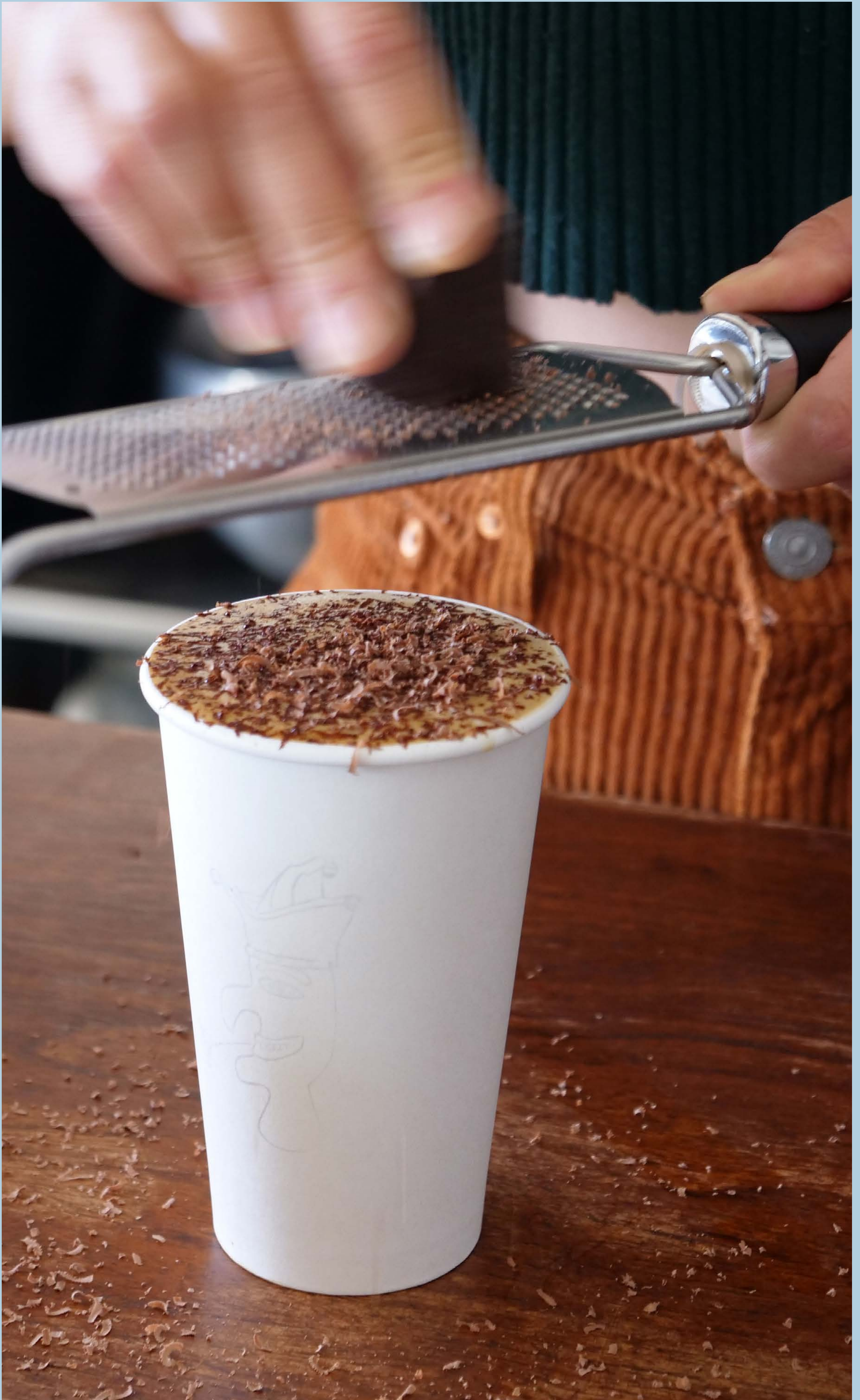
Punch and Daisy