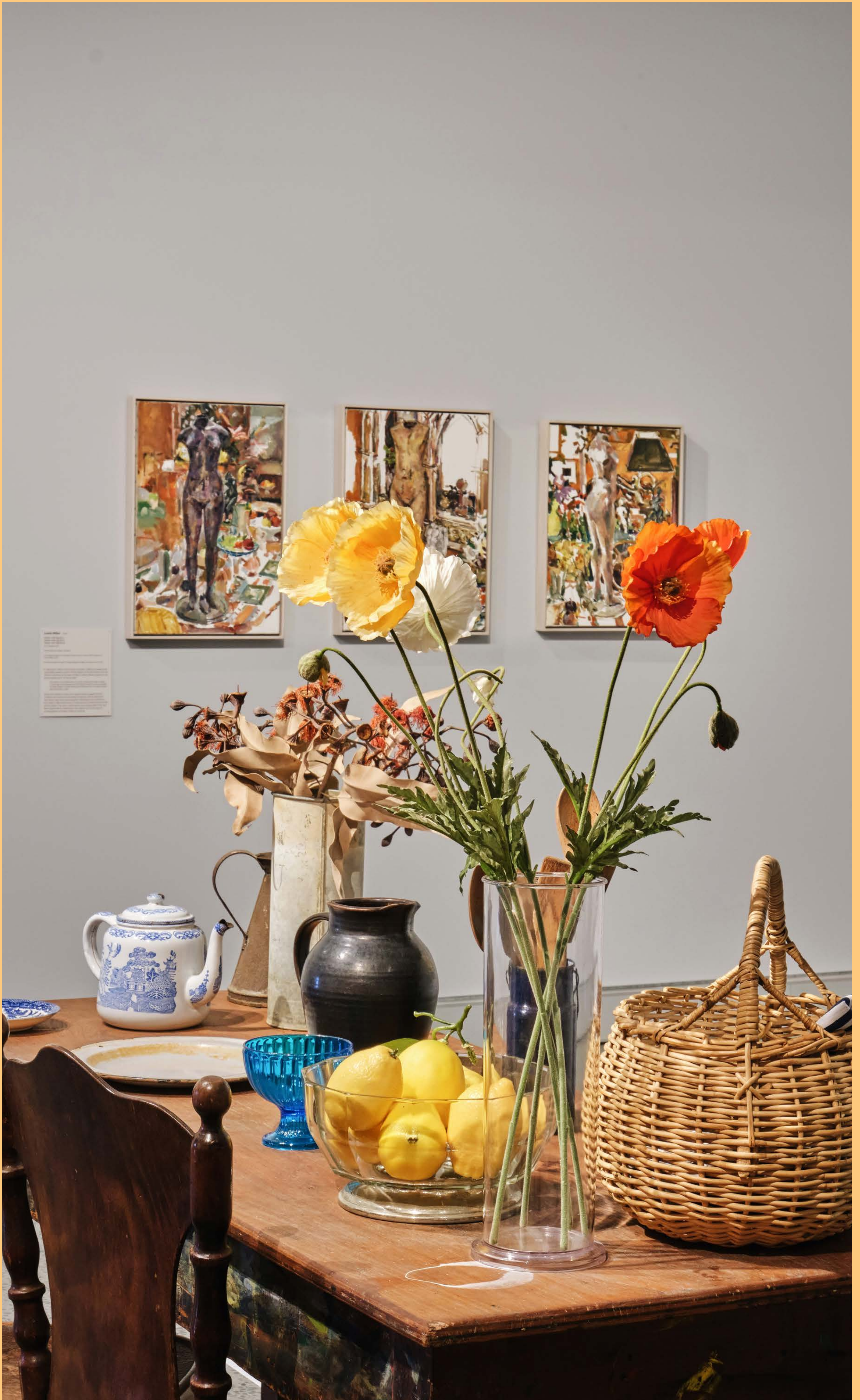
Tweed Regional Gallery & Margaret Olley Art Centre