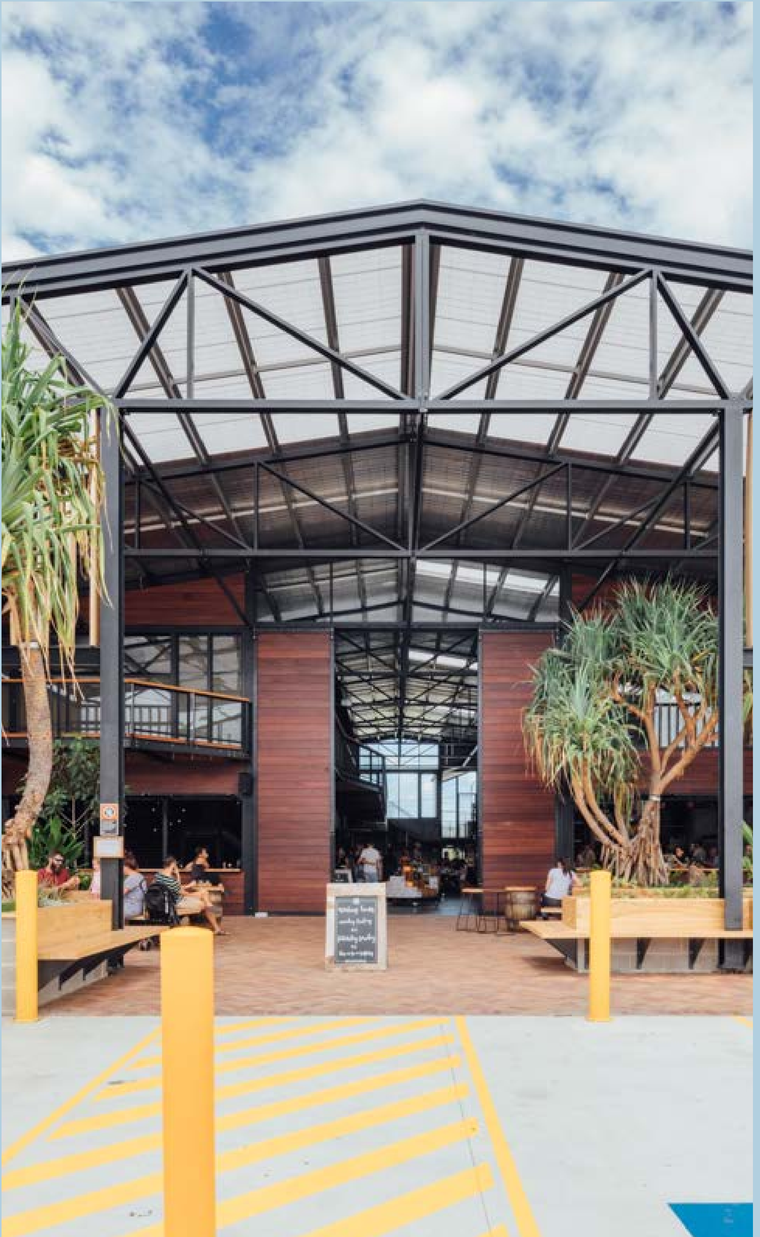
Stone & Wood Brewery