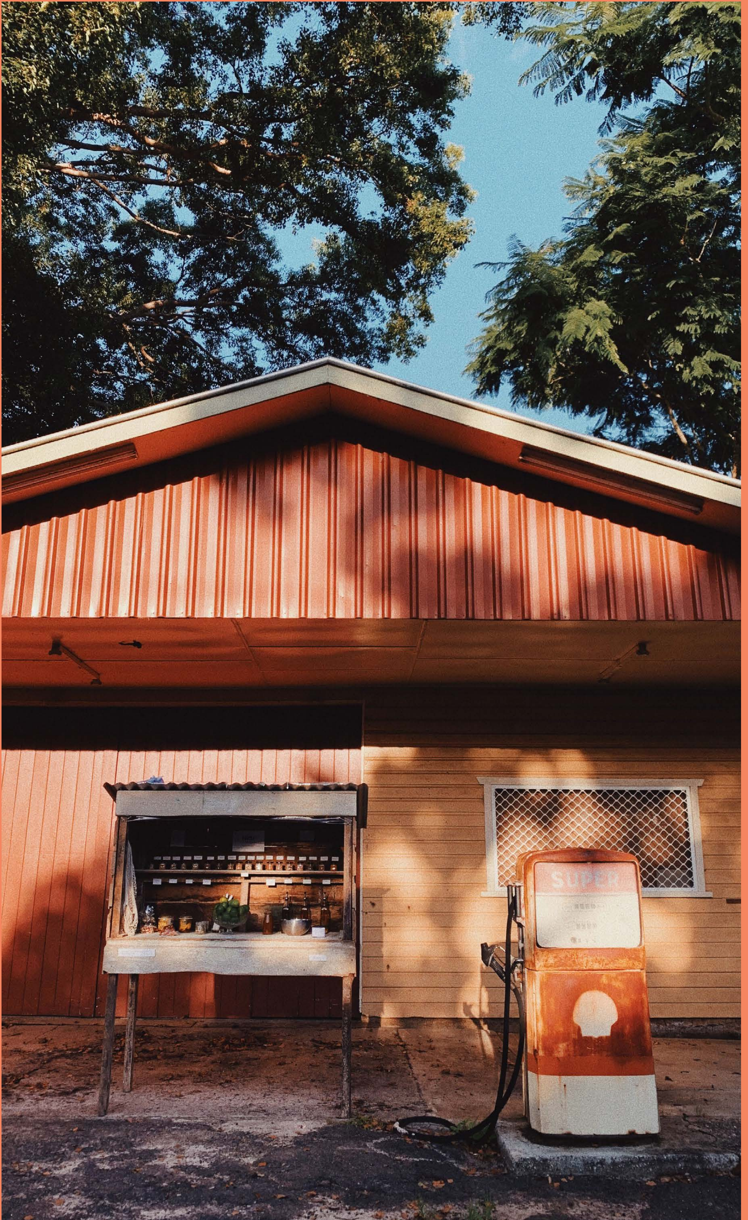
Eureka Station Stall